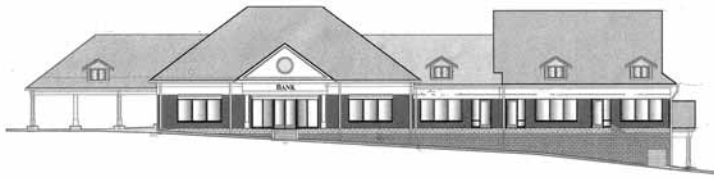
Front (above) and back (below) elevations from the approved site plan of the Petrucelli property