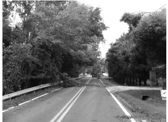
Storm damage along Esworthy Road, a highly traversed commuter route, caused hazardous, potentially life-threatening conditions, yet clean-up efforts were less than responsive. Top, a snapped electrical pole resting on wires. Bottom, one of many examples of debris blocking lanes.

On a happier note, mark your calendars for this year's DCA ANNUAL HOEDOWN ON FRIDAY, OCTOBER 15TH! Please see the notice inside this Little Acorn.