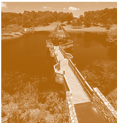
The Darne Bloomers concluded this year's cycle of meetings in May with a tour of Meadowlark Botanical Gardens in Vienna, Virginia.

frost and stored over winter in a cool basement. If you want to risk it, some winters are warm enough that with a thick mulch tender bulbs may survive in-ground. Some cultivars are more cold-hardy than others, as for example gladiolus byzantius. Colchicums, crocus speciosus and crocus sativus are planted in late summer for fall blooms. It's a pleasure to see fresh blooms coming out as most other flowers are fading. These have been deer resistant for me. Some bulbs can also be forced to bloom inside in winter – amaryllis and paperwhite narcissus are commonly used but hyacinths are also easily grown on water after being kept in a refrigerator for 10 weeks.