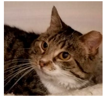
Dixie (left) and Gypsy (right)

Dixie and Gypsy are the last two adoptable cats who are still awaiting permanent homes from this amazing local rescue operation. By adopting one of these girls, you'll be contributing to the happily-ever-after of an already successful story! If you're interested in giving one of these country cats a life in the 'burbs, please contact info@fmca.org .