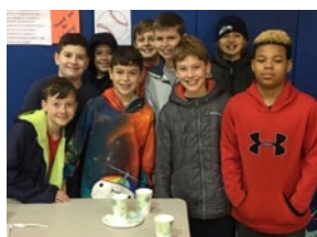
Students raise money and awareness for Dine with Dignity

The holiday season is long over but the staff and students at Darnestown continue to think of and work on behalf of others. In December, the DES staff donated supplies and time to assemble and deliver 200 lunches for a local homeless shelter. In January, students collected funds for Dine with Dignity, which helps pay down MCPS student debt for school lunches. Throughout the month of February,