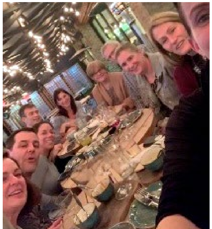
Recent Adult Social at Vasili's, where a percentage of sales benefited the Club!

Come join the fun—our member community is like no other! Continue to check our website for 2020 information!