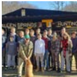
The Hunting Lodge

Our favorite outing of the year was our annual trip to a real hunting lodge located near Wardensville, WV, for a fun-filled winter outing that included rifle and shotgun shooting, archery, a variety of scouting skills (such as first-aid and wilderness survival), as well as plenty of free time to play cards and board games in the cabin. We all had a great time!