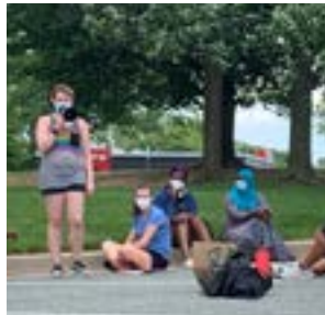
Darnestown families and friends show their support at the community BLM Support Picnic and Fundraiser at Darnestown Park.