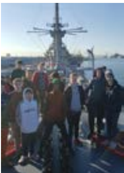
Battleship New Jersey

Independence Hall, the Liberty Bell, and the National Constitution Center. After learning about the exciting beginnings of our nation's government, we headed across the Delaware River to the Battleship New Jersey located in Camden, NJ. The troop was able to explore the ship and spend the night in the bunks as the crew of the USS New Jersey once did!