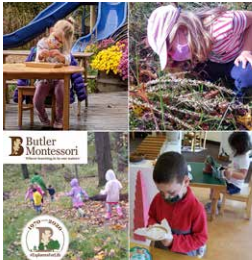
Butler Montessori Dec 2020

Our preschool program (ages 3-6) is in full swing with indoor/outdoor classes, engaging lessons, and hikes on our 22-acre campus. Children love how every school day is fun and doesn't feel like "work." Recently students learned about botany and biology by dissecting