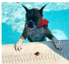
1st Annual Doggie Dip was a huge success for our four-legged members!

Planning for next summer has already begun, and we are hoping to have all our programming fully active—summer camp, swim team, tennis and pickleball, yoga, and social events. And our off-season project for early spring will be the pool resurfacing.