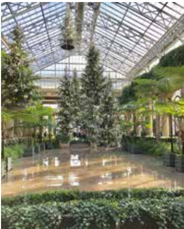
Longwood Gardens in December

In October, there was a socially-distanced plant swap. The Fall is a superb time to divide your perennials, and share. Members set up tables in a neighborhood cul-de-sac and safely brought and took home plant specimens from other member’s gardens.