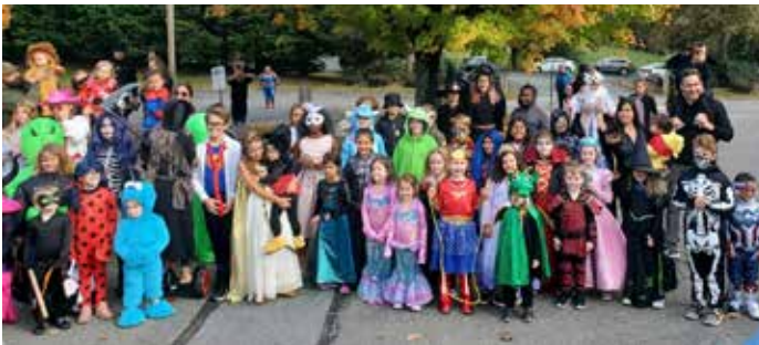
In Spring Meadows, a hauntingly adorable parade marched to music while showing off creative costumes.

Halloween looked more "normal" this year with kids dressed in costume, walking neighborhoods, and trick-or-treating once again. Here's a look at some Halloween fun in Darnestown.