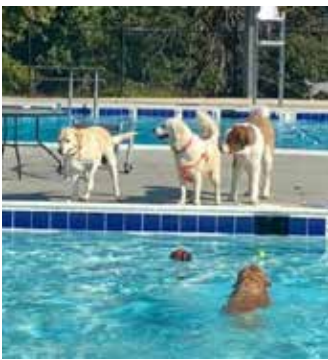
It's a Doggie take-over! 2nd Annual Doggie Dip

What a great 2021 season we have had, with all programing running on full cylinders and a lot of new families joining our DSRC community! If all these great things continue, we are hoping our Club could be at full capacity next summer.