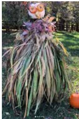
A trip down Esworthy showed off the annual Esworthy scarecrow contest.