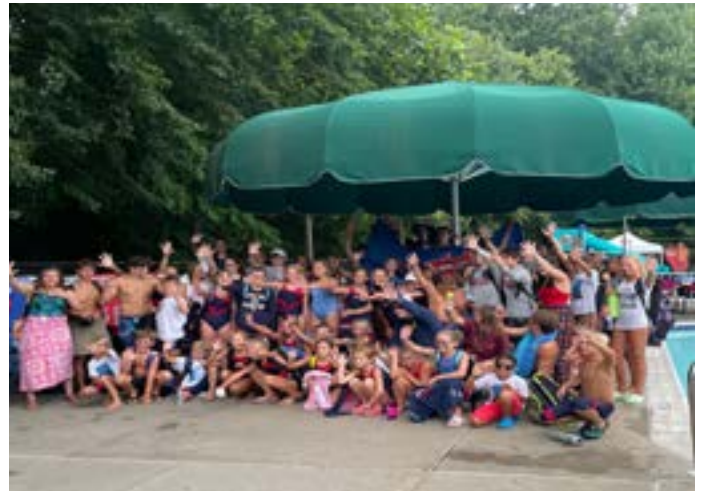
Our Undefeated Demons: 5-0

Our membership is at full capacity, and the pool has been hustling and bustling all