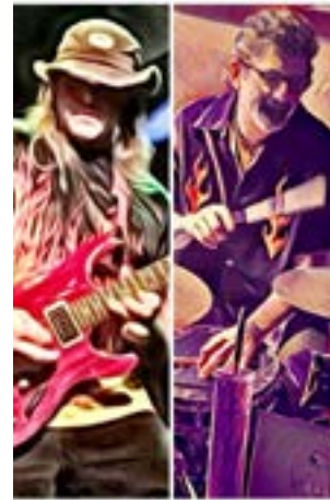
Billy and Boogie

Visit DARNESTOWNCIVIC.ORG to purchase tickets.