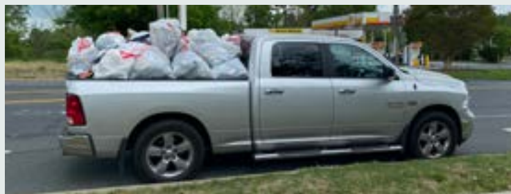
Darnestown residents filled an entire truck full of garbage at the first annual clean up day. Thank you to all who participated!