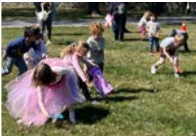
Children participate in the egg roll event at the annual Easter Egg Roll

we partnered with the Darnestown Presbyterian Church (DPC) and held the Second Annual Darnestown Easter Egg Roll on March 26th. Over 2,000 Easter eggs were hunted! The beautiful sunny afternoon was filled with lots of treats, crafts, photo ops, and fun! We already can't wait to do it again next year.