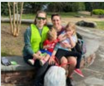
The Probus Family