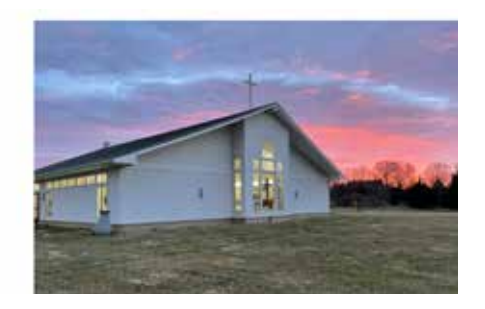
The Buzz at St. Nicholas'

(Published in the Diocesan Bulletin newsletter of the Episcopal Diocese of Washington on Thursday, July 6, 2023.)