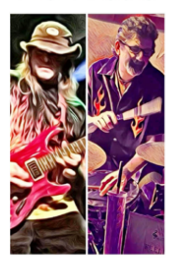
Billy and Boogie

Visit DARNESTOWNCIVIC.ORG to purchase tickets.