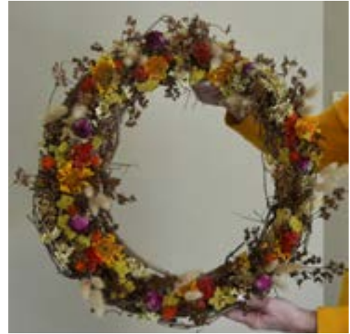
Dried Flower Wreath

members were given a tour of the Rocklands Winery.