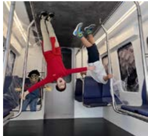
Seneca students visit the Museum of Illusions

As part of Seneca Academy's integrated IB curriculum, our students extend their learning on field trips! So far this year they have visited the Museum of Illusions and the Smithsonian National Museum of Natural History in Washington, D.C., Farm at Home in Poolesville, Kids Play Gallery in Gaithersburg, the Chesapeake Watershed here in Montgomery County, Gaver Farm in Frederick, and the Maryland Science Center in Baltimore. There are many more exciting field trips in store in the coming months!