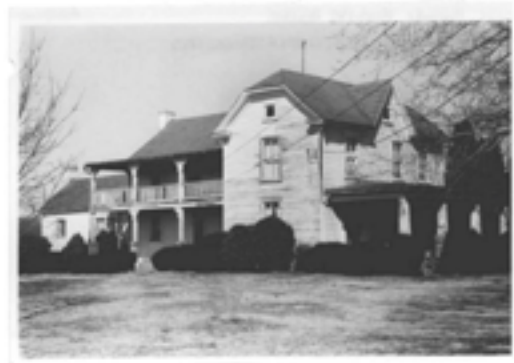
Two pictures of the former Cissel farmhouse, c. 1975.

We Welcome Your Submissions to The Little Acorn