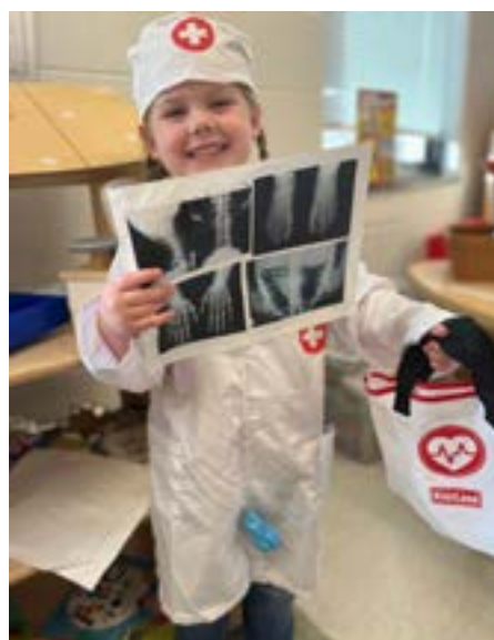
Georgetown Hill students learn how to keep bodies healthy through nutrition and exercise

It's that time of year again when cold and flu season is upon us. Many of our parents have asked us how we can keep our little ones and families healthy this winter. At Georgetown Hill, our top priority is to keep our kiddos safe and healthy. Our staff sanitizes all surfaces and toys several times a day. We teach the children to wash their hands properly, using warm water and soap, for at least 20 seconds. Children are asked to wash their hands upon arrival, before meals, after outside play, and of course, after using the bathroom. Another way to keep your child healthy is to make sure they