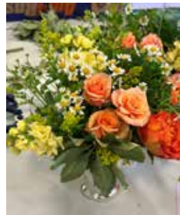
Service Project Bouquet

For the Darne Bloomers service project in January, members once again created small floral arrangements for inpatients at local care facilities, including the Village at Rockville Health Center, the Nightingale House on Darnestown Road, and Darnestown Gardens As-