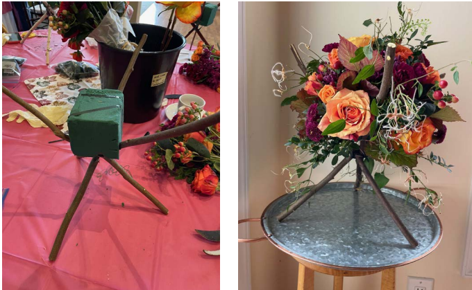
November flower arrangements using a tripod

vided with a gorgeous assortment of roses, mums, and hypericum berries in fall oranges, reds, golds, and purples, as well as assorted purchased and foraged greens and fall elements. The finished products were spectacular and ranged from tightly packed globes to free-form explosions of flowers. Best of all, the tripods can be collapsed and re-used.