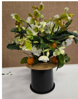
Ami Wilbur arrangement from the January meeting of the Darne Bloomers Garden Club

rie Merriweather Post, who stipulated in her will that fresh cut flowers would be on display in the mansion at all times. Ami provided a glimpse into her role in the creation of floral arrangements and displays on the property, which includes formal and cutting gardens as well as greenhouses, noting that planning is already in the works for the 2026 cutting gardens, and that trends at the estate include shifting from traditional cutting flowers to more native plants and away from typical symmetrical arrangements toward more natural but still traditional ones. As she spoke, Ami created a gorgeous all-sides arrangement including lady slipper